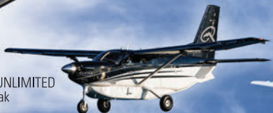
AVIATION UNLIMITED Quest Kodiak