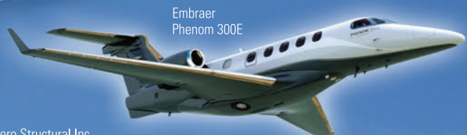
Embraer Phenom 300E