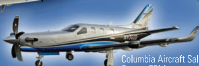
Columbia Aircraft Sales Socata TBM