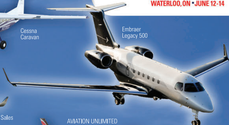
Embraer Legacy 500