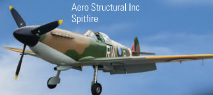
Aero Structural Inc Spitfire