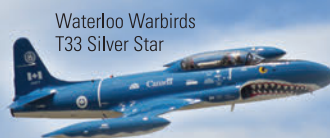
Waterloo Warbirds T33 Silver Star