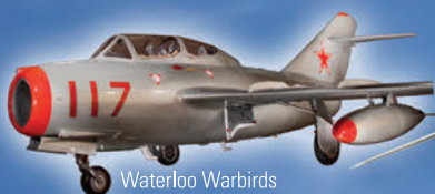
Waterloo Warbirds MiG-15