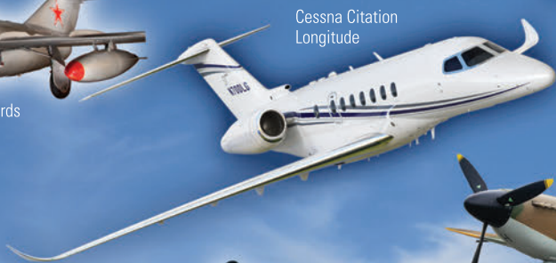
Cessna Citation Longitude