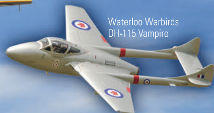
Waterloo Warbirds DH-115 Vampire