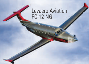
Levaero Aviation PC-12 NG