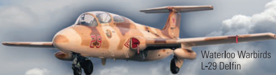
Waterloo Warbirds L-29 Delfin