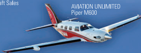
AVIATION UNLIMITED Piper M600