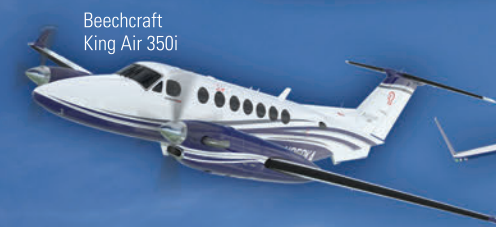
Beechcraft King Air 350i