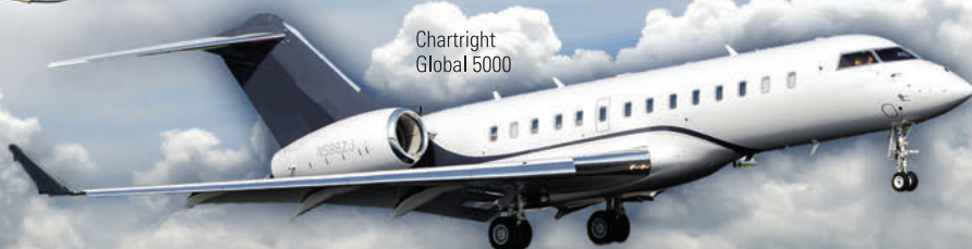
Chartright Global 5000