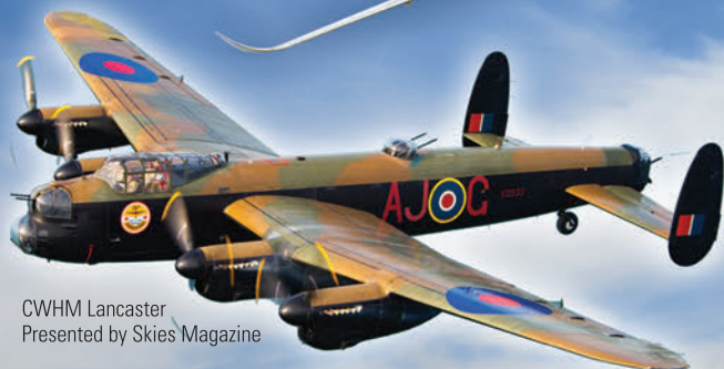
CWHM Lancaster Presented by Skies Magazine