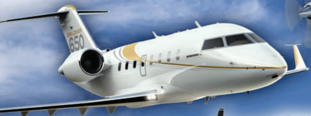
Bombardier Challenger 650