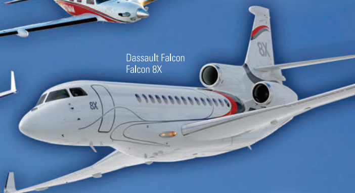
Dassault Falcon Falcon 8X